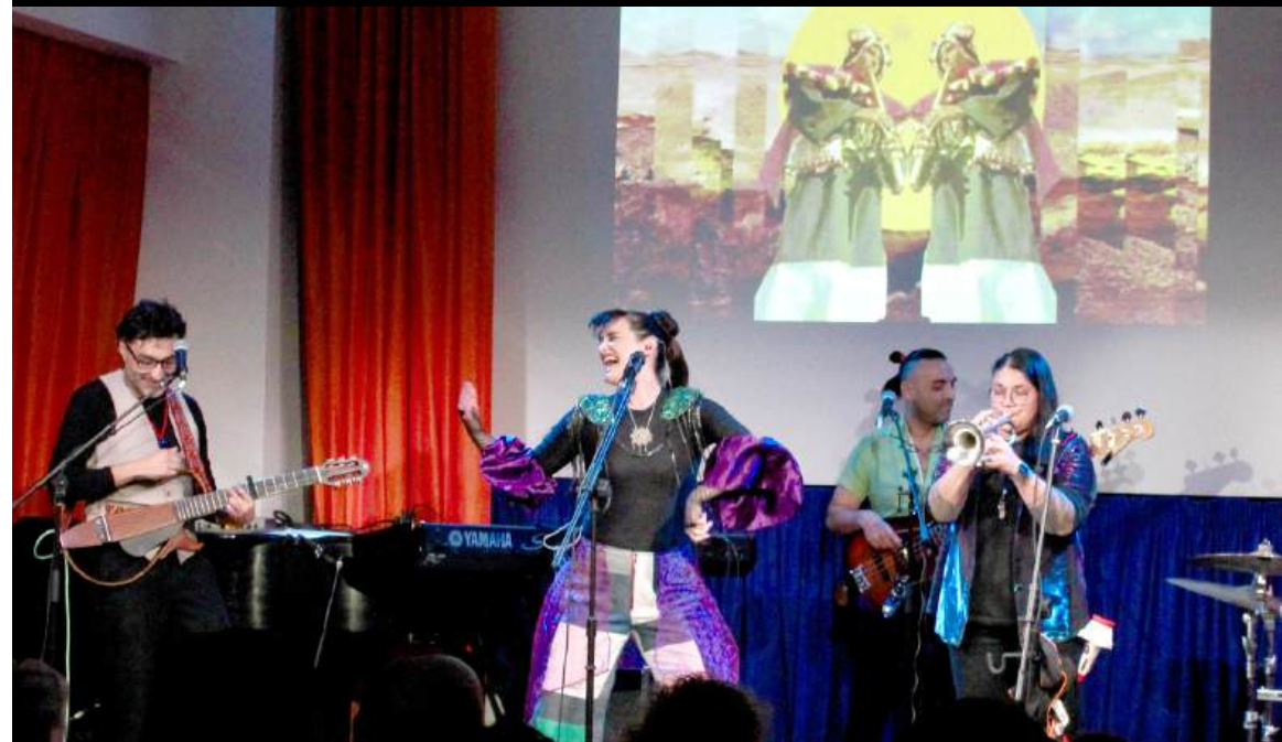
Image: Pascuala Ilabaca performs at City of Asylum in Pittsburgh, PA.