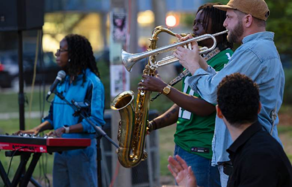
Image: Clark Park Jazz Pop Up as part of the Philly Jazz Month 2025.