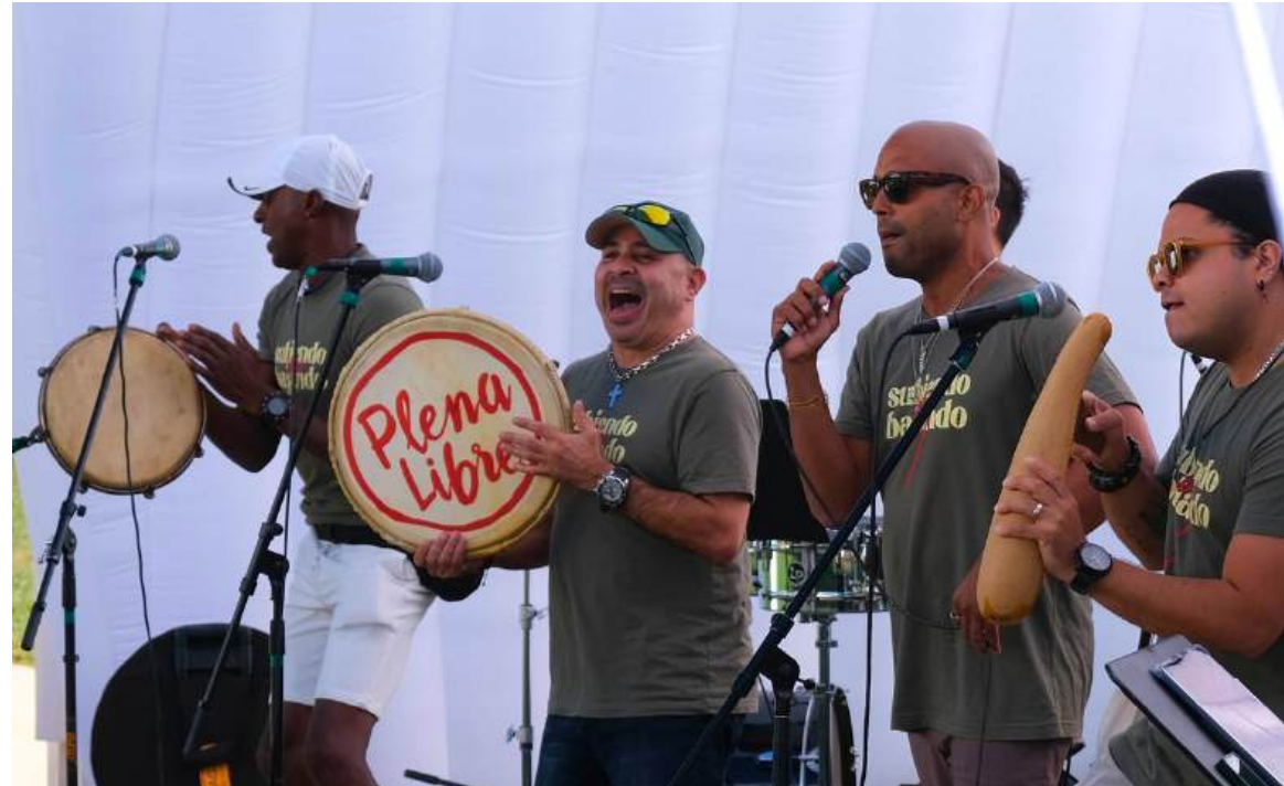
Image: Plena Libre at Frostburg State University.