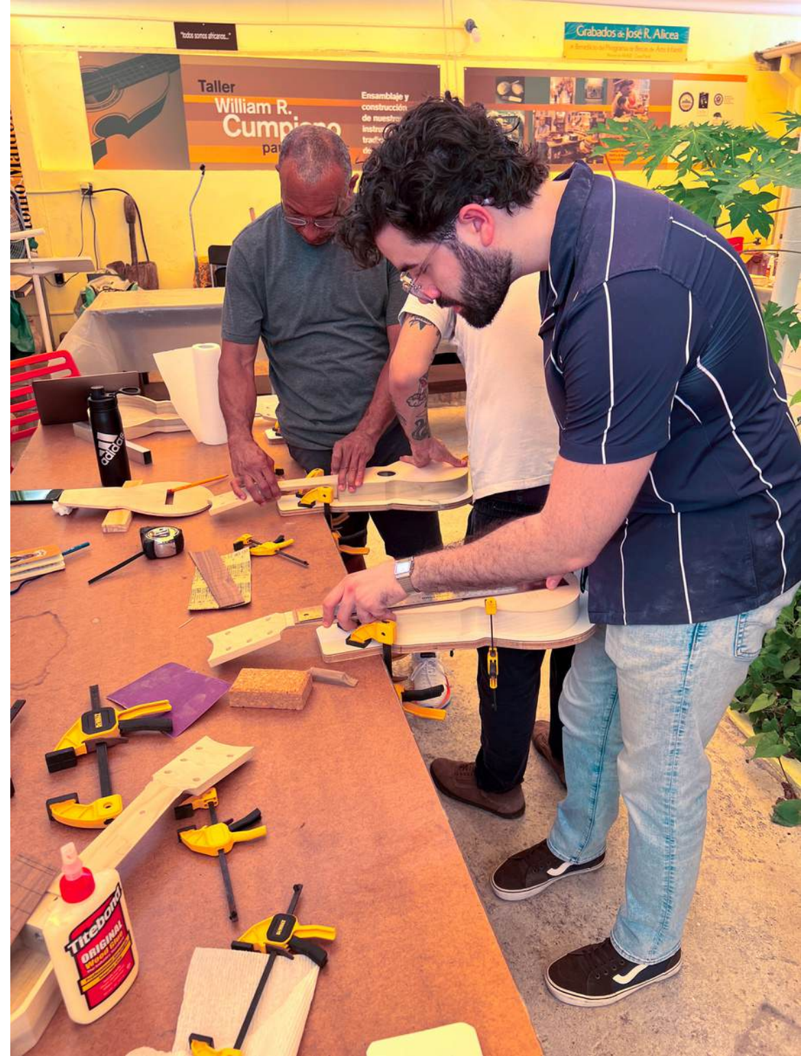
Image: Tiple building workshop Centro de Investigaciones Folklóricas de Puerto Rico, Ponce (PR).