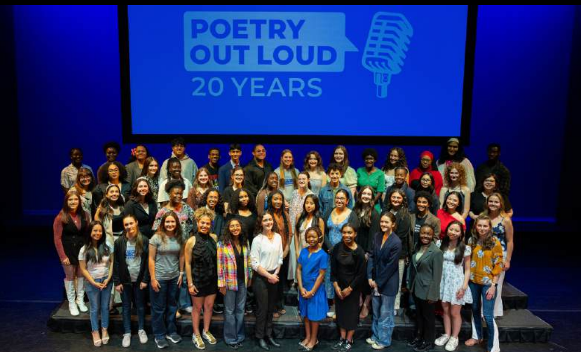
Image: Poetry Out Loud 2025 State Champions.

In April 2025, Mid Atlantic launched Philly Jazz Month with something for everyone to enjoy, from eclectic live performances to in-school educational programs designed to unite communities and uplift local artists in Philadelphia. This annual month-long event is produced in partnership with Creative Philadelphia.