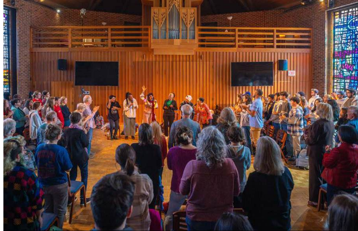
Image: The Legacy of American Protest Music, Shenandoah University. Goodson Chapel—Recital Hall.

Mid Atlantic Arts provides Information Services to artists, organizations, constituents, and stakeholders on a regular basis and through a number of communication platforms. Information is provided via monthly newsletters, eblasts, social media postings, and press releases. Mid Atlantic Arts manages midatlanticarts.org providing detailed information on Mid Atlantic, its programs, and grant opportunities for artists and organizations.