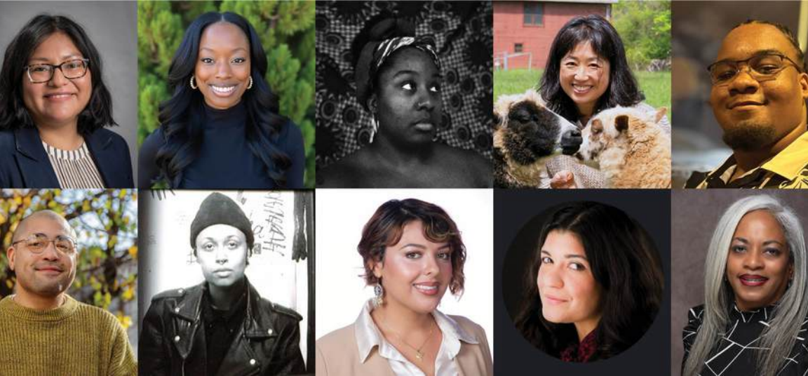
Image: Mid Atlantic Arts National Leaders of Color Fellows 2025.