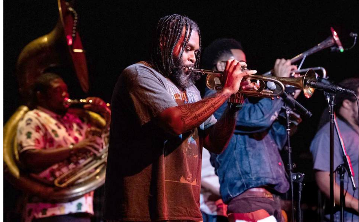
Image: The Soul Rebels perform at the Exit Zero Jazz Festival.

Mid Atlantic Tours brings the best of the performing arts to communities across the mid-Atlantic region. Presenters select from a curated roster of artists that changes annually but maintains a programmatic commitment to a diversity of performance genres, regional artist representation, and engagement with communities underserved by the arts.