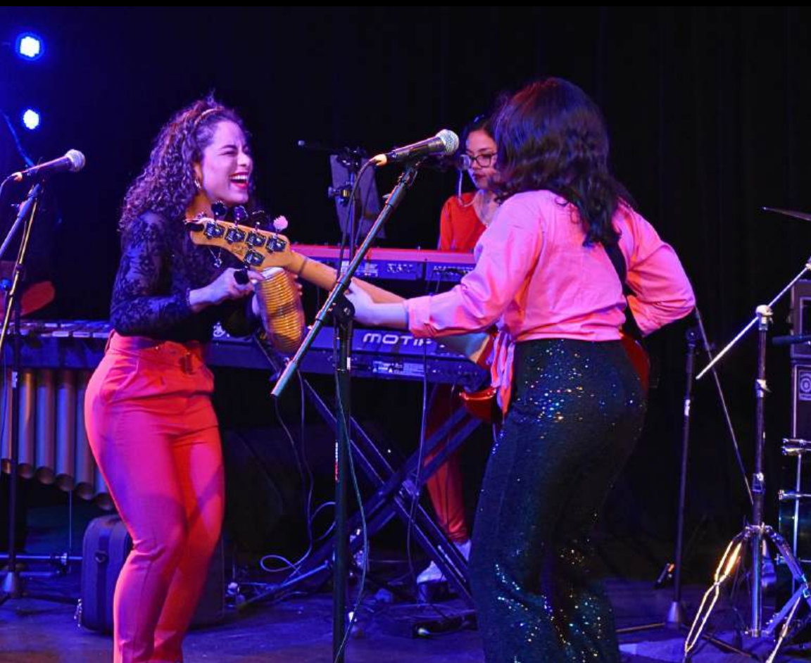
Image: Las Guaracheras at Columbia Center for the Arts.

The National Leaders of Color Fellowships is a transformative leadership development experience curated by WESTAF to establish multicultural leadership in the creative and cultural sector. By partnering with the other United States Regional Arts Organizations, the program has expanded nationwide, and its mission has become a national endeavor.