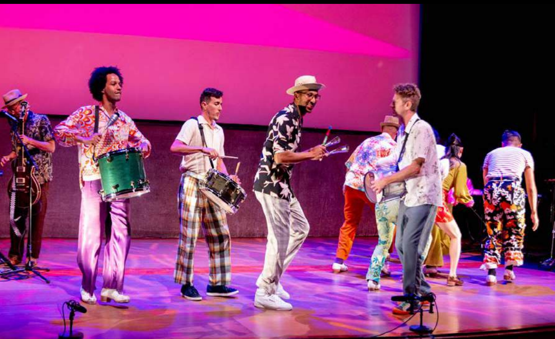
Image: Music From The Sole at the Guggenheim Museum in Bilbao, Spain.

The Special Presenter Initiatives provide additional opportunities for the support of small to mid-sized performing arts presenters in Delaware, the District of Columbia, Puerto Rico, the U.S. Virgin Islands, and West Virginia. Fee support is available for engagements of performing artists based anywhere worldwide. Engagements include performances as well as community activities that enhance the performance experience and offer meaningful exchanges between touring artists and a presenter's community.