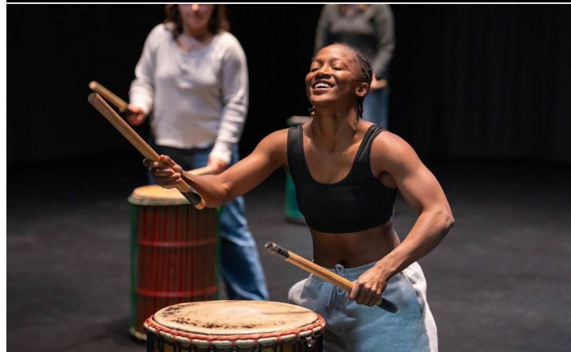
Image: A member of Cirque Kalabante leads an African Drumming workshop at the Moss Arts Center.