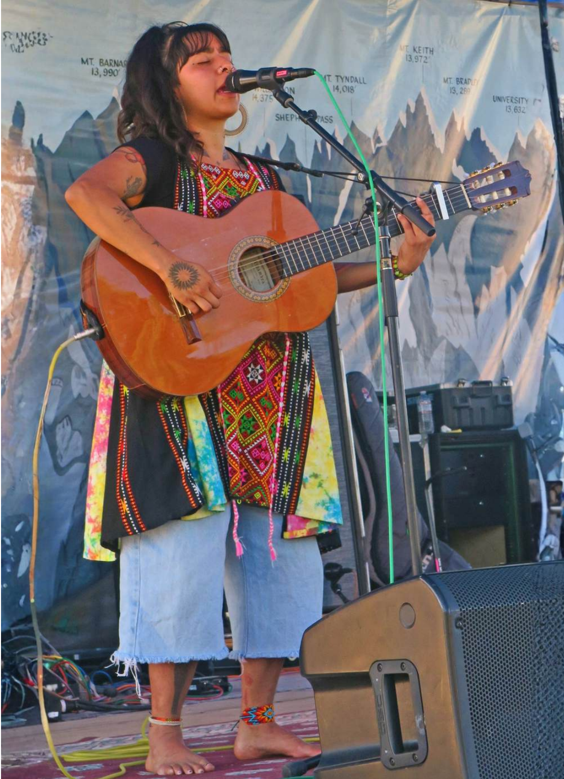
Image: La Muchacha, INYO Council for the Arts Millpond Music Festival, California.