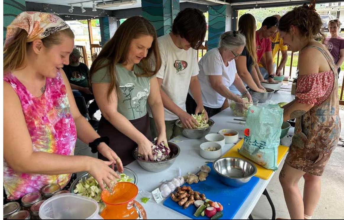
Image: Fermentation class with the River House in Capon Bridge, WV.

Cultural Sustainability: Community Roots provides unrestricted operational funding to arts organizations founded by, with, and for communities of color, allowing them to sustain and expand their practices, benefiting the communities they serve. It also supports cross-cultural arts experiences and fosters stronger collaboration between artists, communities, and the RAO's. Cultural Sustainability: Community Roots is a partnership between the six U.S. Regional Arts Organizations and The Wallace Foundation.