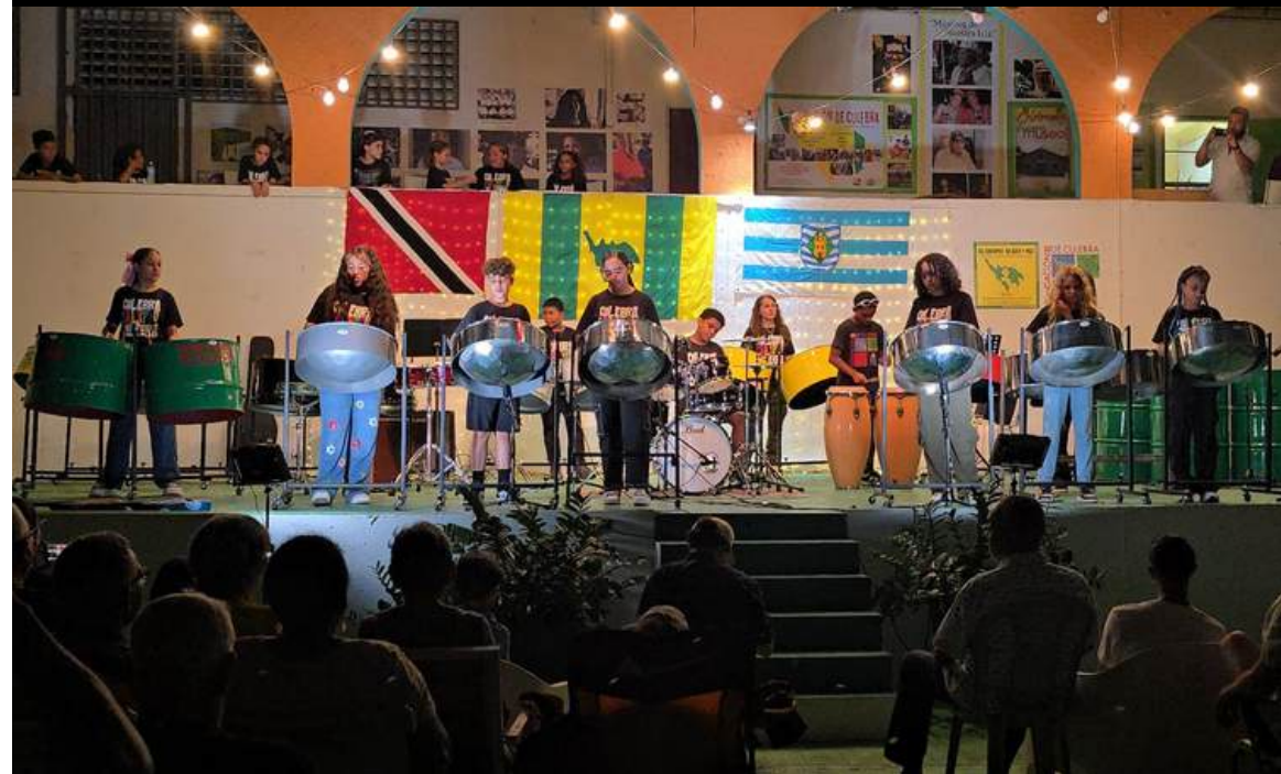
Image: Música Pa' Culebra. Fundación de Culebra, PR.