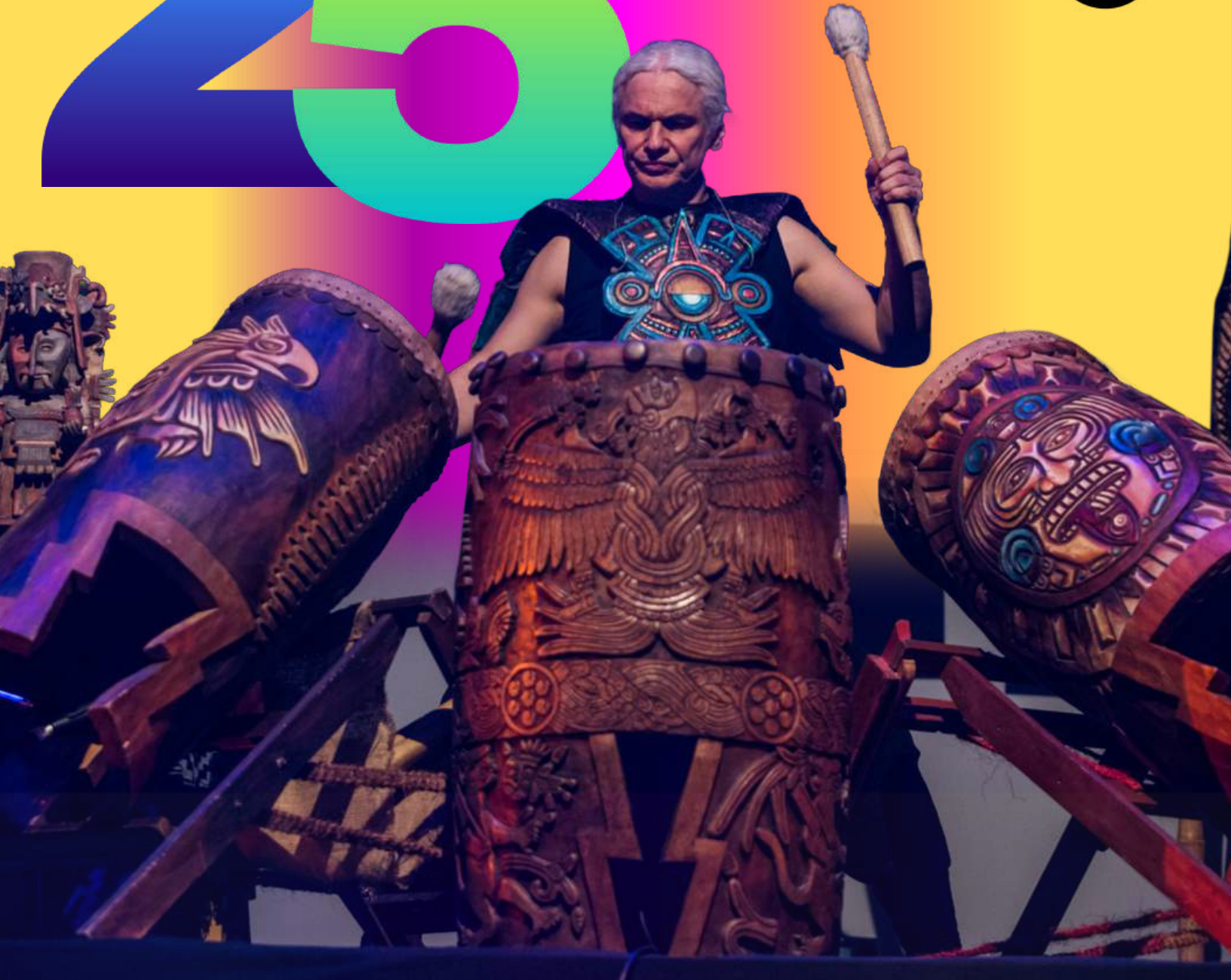
Image: Orchestra of Indigenous Instruments and New Technologies.