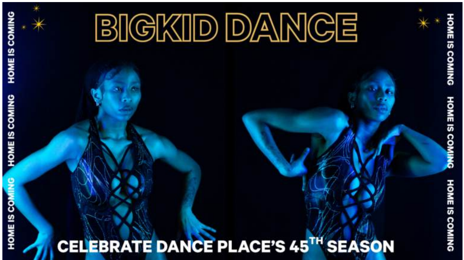
Image: A promotional graphic for BIGKID DANCE features a dancer in blue-lit, expressive poses celebrating Dance Place's 45th season. "HOME IS COMING."