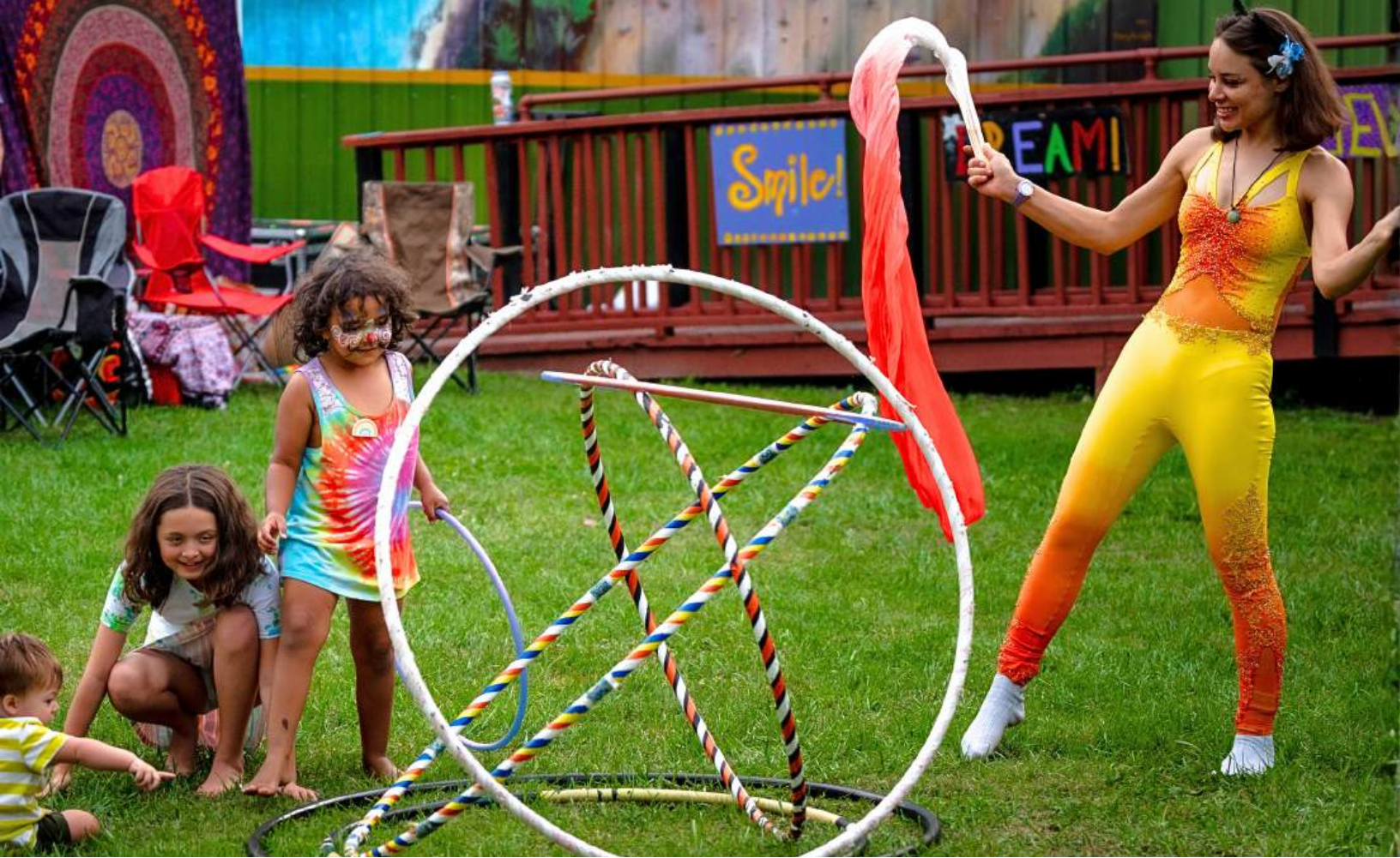
Image: Young participants enjoy a flow movement workshop by Fluidity Performance Troupe at the 21st annual Culturefest World Music & Arts Festival in The Grassroots District of Princeton, WV.