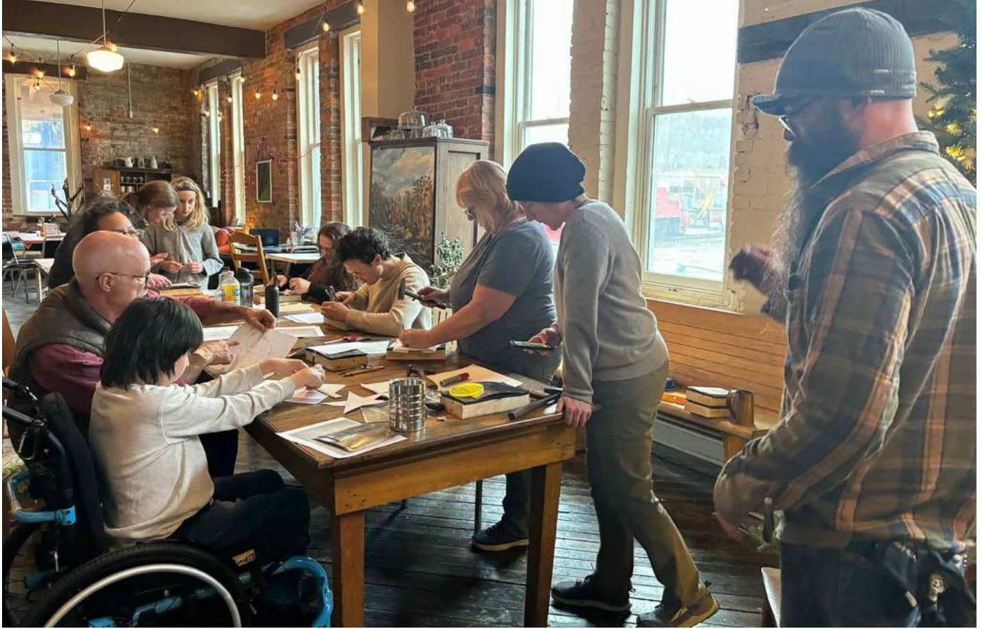
Image: Punched Tin Workshop with Folk Flair at The iNFAMOUS Art Collective.