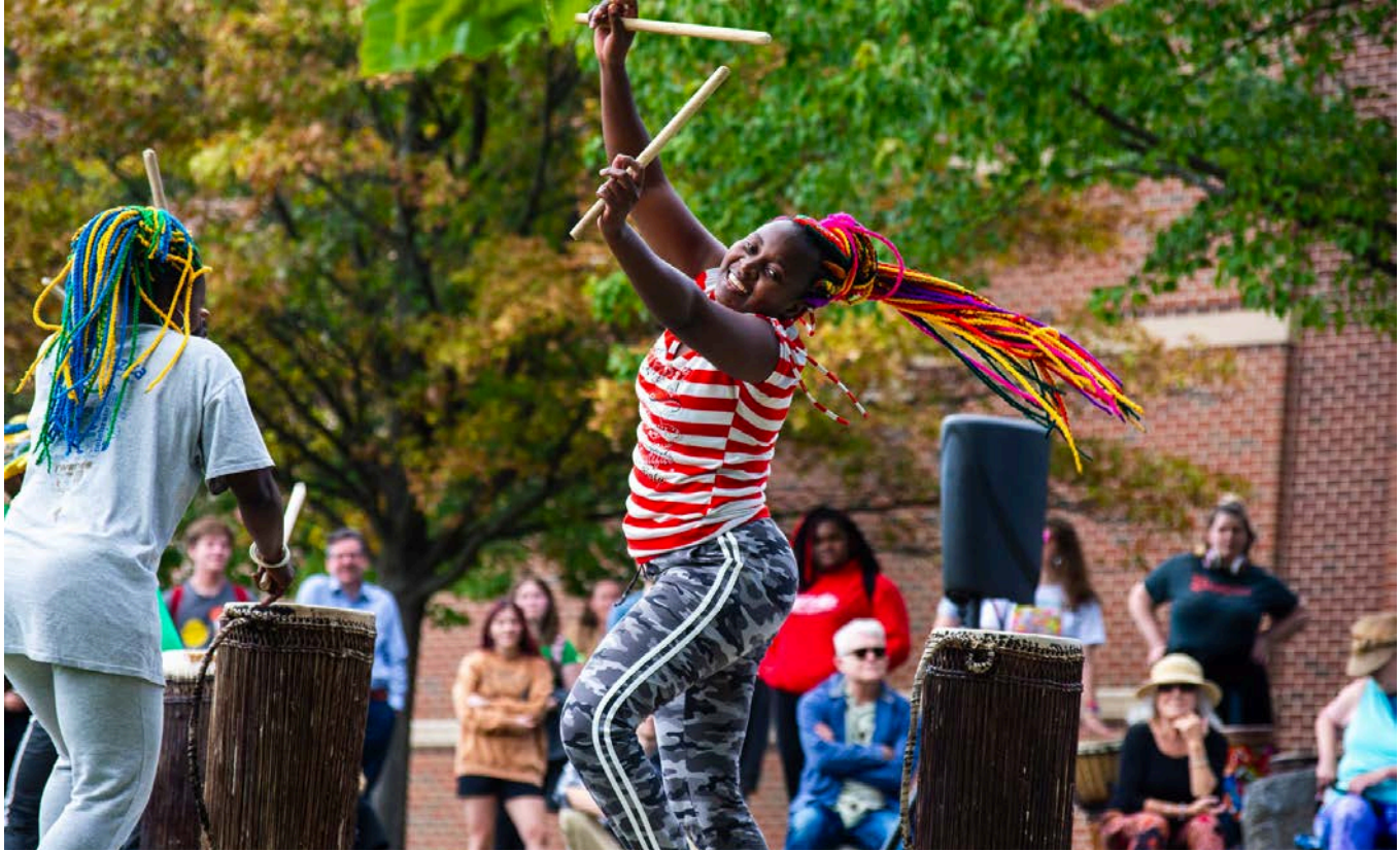
Image: The Book of Life project at Shenandoah University, Winchester, VA.

Mid Atlantic Arts supports artists, presenters, and organizations through unique programming, grant support, partnerships, and information sharing. Created in 1979, Mid Atlantic Arts is aligned with the region's state arts councils and the National Endowment for the Arts. We combine state and federal funding with private support from corporations, foundations, and individuals to nurture diverse artistic expression while connecting people to meaningful arts experiences within our region and beyond.