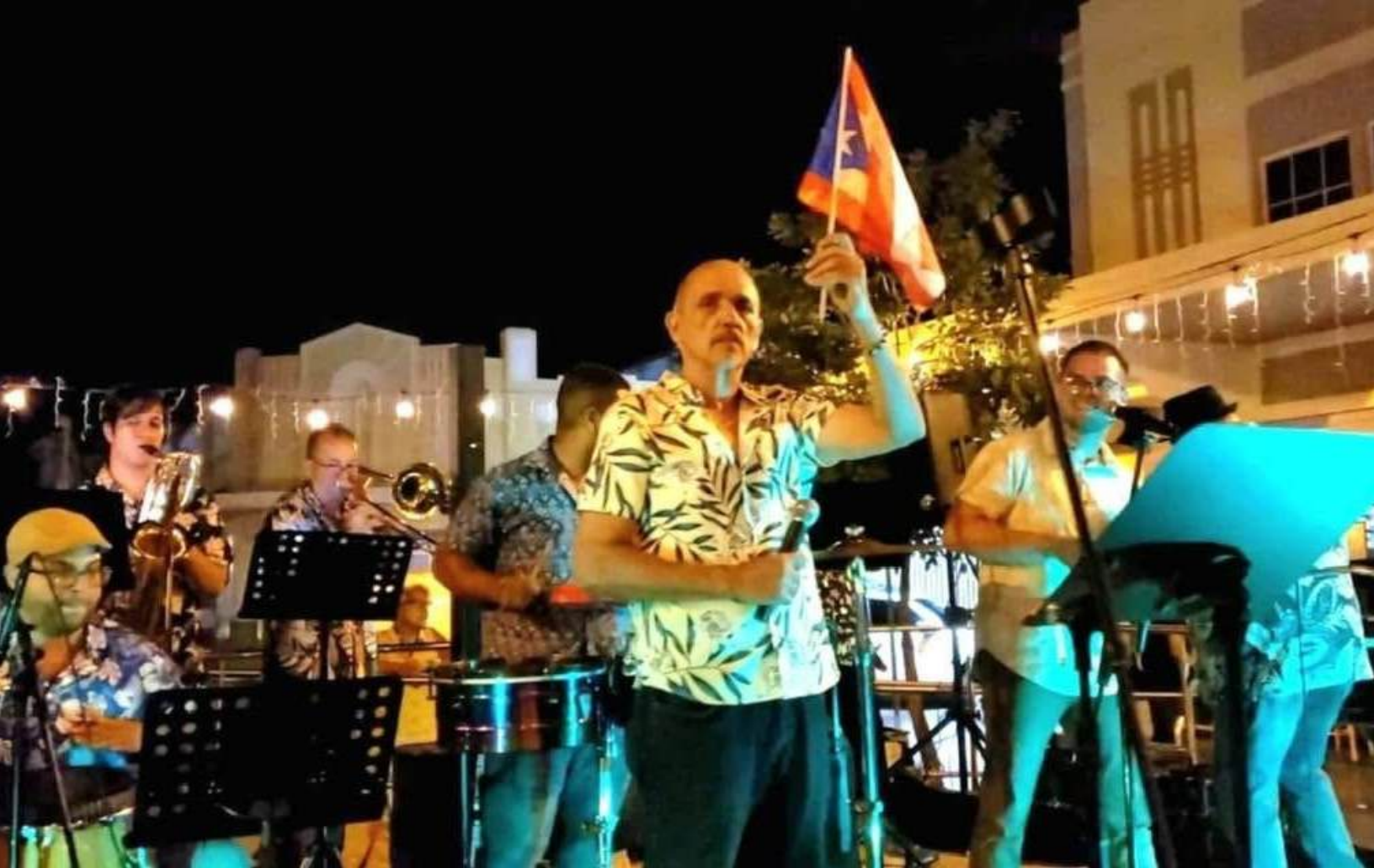
Image: Pleneros del Barrio performing at Feria de Los Hijos de Bélgica in Ponce, Puerto Rico.