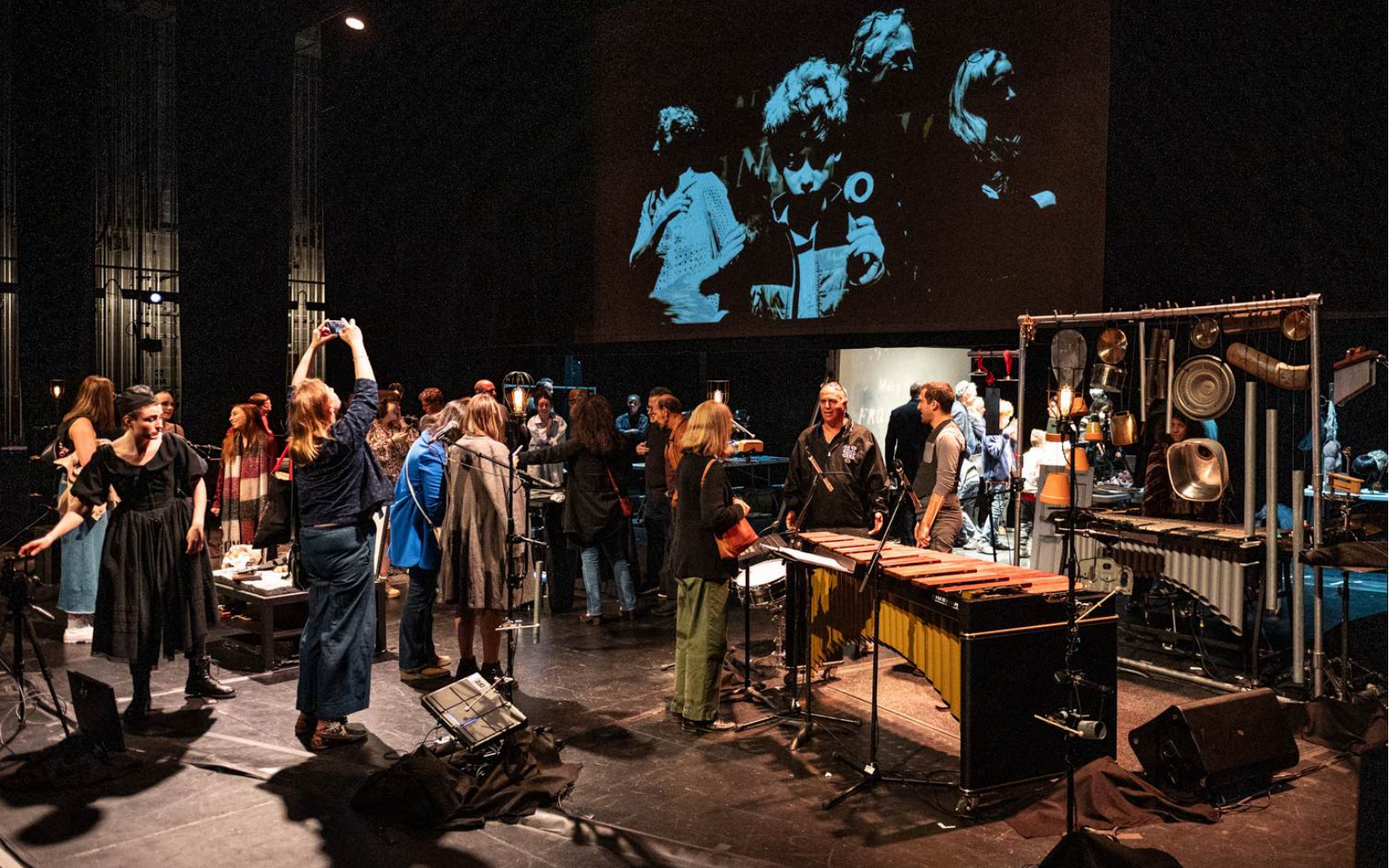
Image: Performance of Frankenstein by Manual Cinema on stage at The Performing Arts Center, Purchase College.