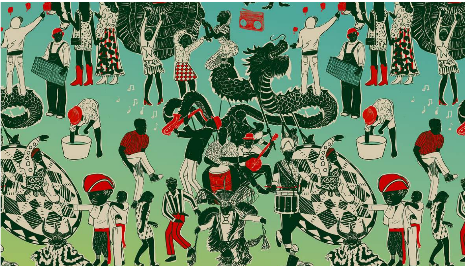
Image: Cultural Sustainability: Community Roots Program Graphic. Credit: Illustration by Uzo Njoku.

Being open to change and committing to innovation