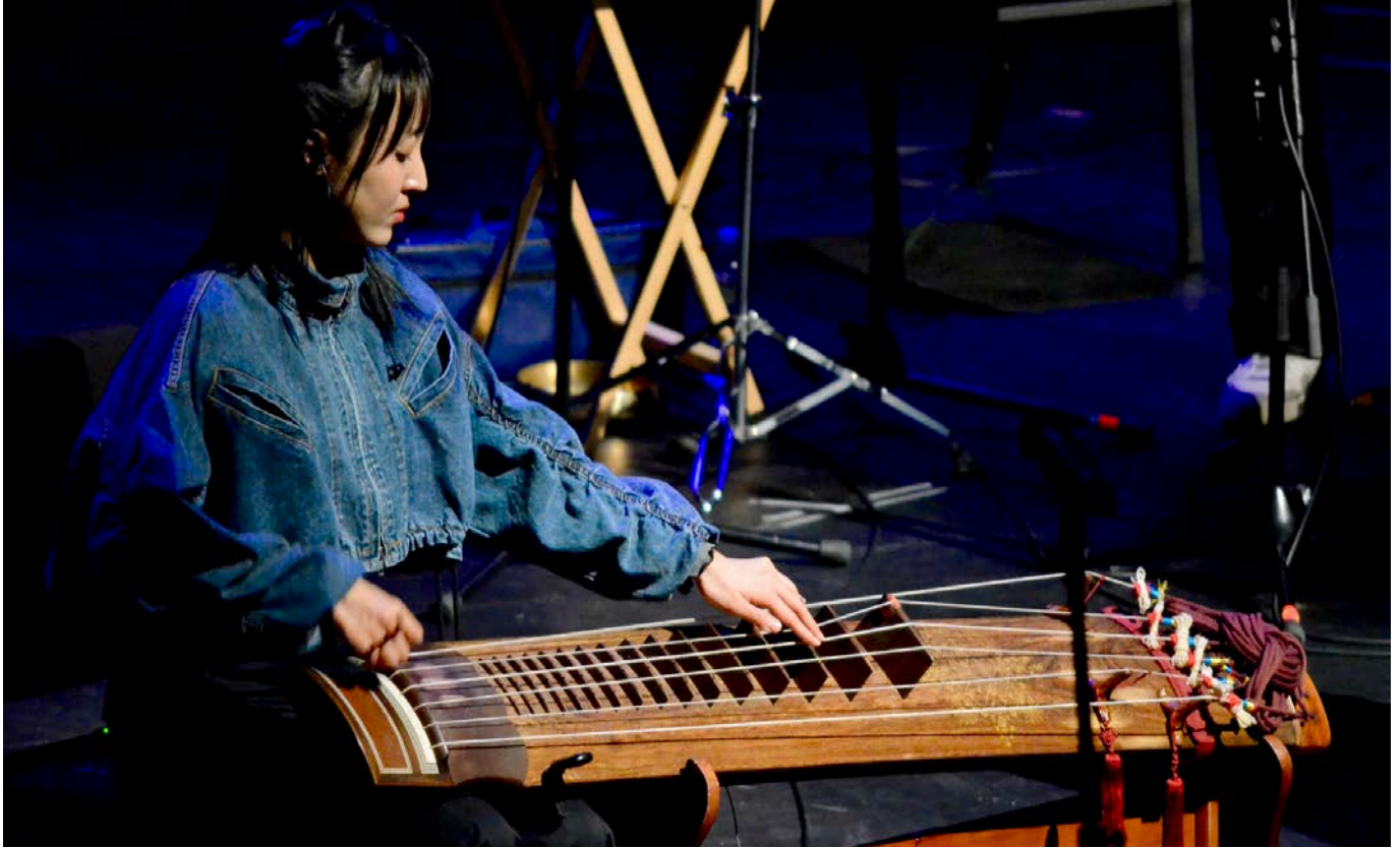
Image: Coreyah at William Paterson University in Wayne, NJ.

Mid Atlantic Arts supports artists, presenters, and organizations through unique programming, grant support, partnerships, and information sharing. Created in 1979, Mid Atlantic Arts is aligned with the region's state arts councils and the National Endowment for the Arts. We combine state and federal funding with private support from corporations, foundations, and individuals to nurture diverse artistic expression while connecting people to meaningful arts experiences within our region and beyond.