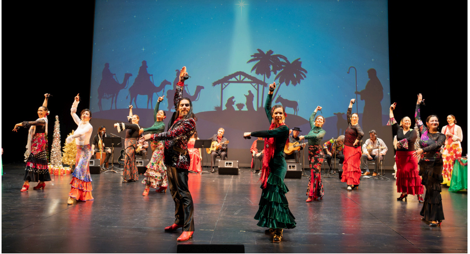
Image: Navidad Flamenca at the Atlas Performing Centre.

Mid Atlantic Arts supports artists, presenters, and organizations through unique programming, grant support, partnerships, and information sharing. Created in 1979, Mid Atlantic Arts is aligned with the region's state arts councils and the National Endowment for the Arts. We combine state and federal funding with private support from corporations, foundations, and individuals to nurture diverse artistic expression while connecting people to meaningful arts experiences within our region and beyond.