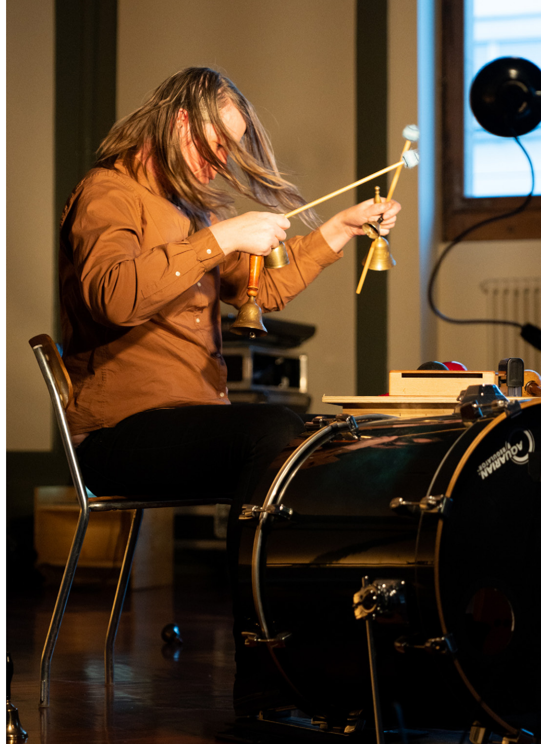
Photo: Sarah Hennies performing "Falsetto" at the 2023 Archipel Festival, Geneva, Switzerland with support from USArtists International.

Gifts made between July 1, 2022 and June 30, 2023.