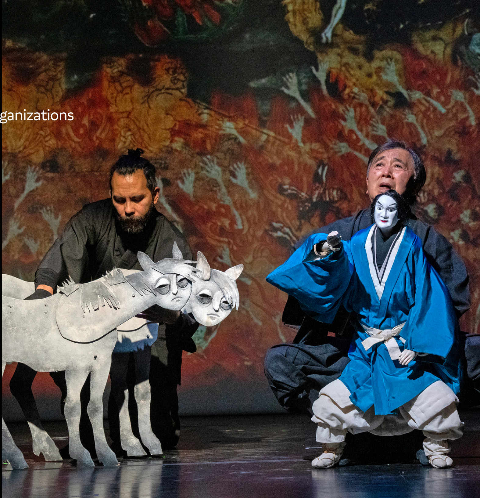
Photo: Scenes from Akutagawa's short story Hell Screen (1918) presented at The Japan Society with support from ArtsCONNECT.