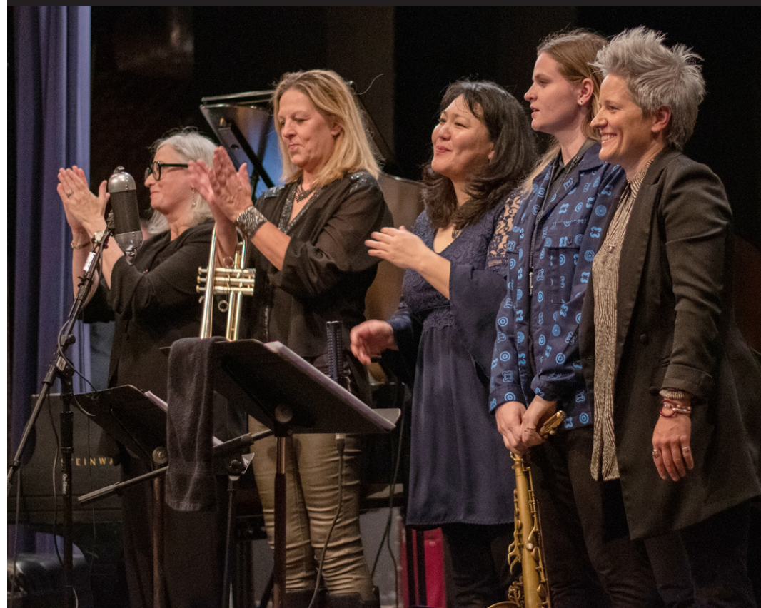
Bottom photo: Jazz Touring Network member Arden Club (Arden DE) hosted Artemis at Arden Gild Hall.