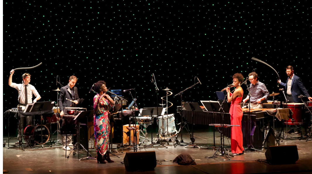
Top photo: Rowan University (Glassboro, NJ) presented Third Coast Percussion with Flutronic as part of a 2023 ArtsCONNECT tour.

The National Leaders of Color Fellowships is a transformative leadership development experience curated by WESTAF in order to establish multicultural leadership in the creative and cultural sector. By partnering with the other United States Regional Arts Organizations, the program has expanded nationwide and its mission has become a national endeavor.