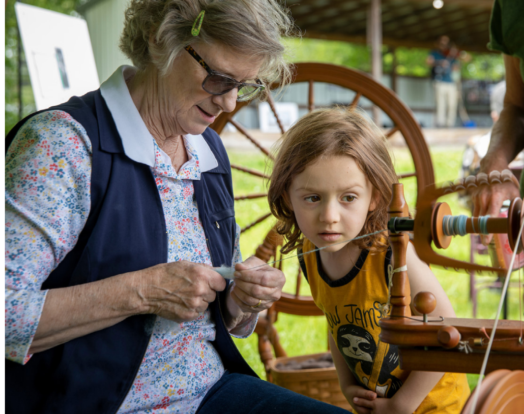
Top photo: The first event of an event series called, "Living Traditions" was held at the Albany Independent Fairground, in Albany, Ohio in 2023. Supported by a Central Appalachia Living Tradition Experiences grant, this event was a celebration of local traditions, the people who do them, and the communities surrounding them.

Mid Atlantic Arts values the abundant and expansive diversity that exists within our region, our nation, and the world. We honor and celebrate the mid-Atlantic's people, artistic and community resources and, most notably, our many forms of cultural expression, and believe them to be major sources of strength in our region.