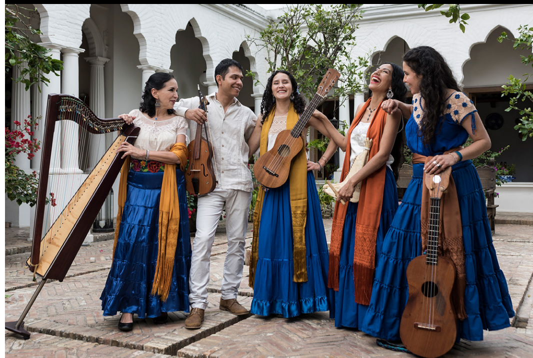
Bottom photo: Iber Exchange artist Caña Dulce y Caña Brava (Mexico).