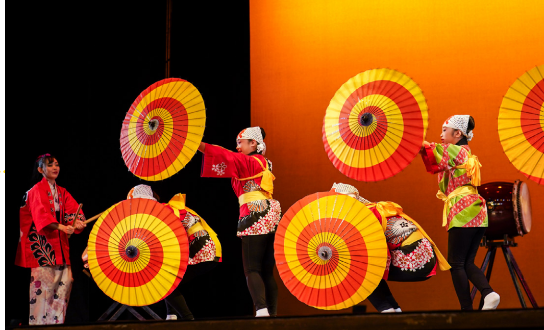
Top photo: The Japanese Folk Dance Institute of NY (New York, NY) hosted a week-long event featuring cultural workshops, and culminating in a collaborative performance, The Festival of Japan: Drums + Dance, with support from the Folk and Traditional Arts Community Projects Grants program.

Central Appalachia Living Traditions (CALT) Central Appalachia Living Traditions (CALT) is a multiyear program designed to promote the understanding and recognition of folk arts and culture in Central Appalachia by investing in cultural communities, seeding new folk and traditional arts experiences, and honoring underrecognized practitioners of traditions across the region.