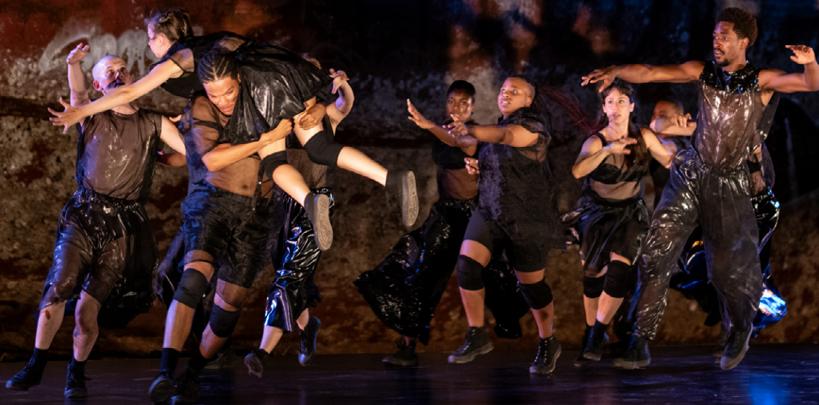
Photo: PEARSONWIDRIG DANCETHEATER (MD) appeared at the European Capital of Culture, Greece with support from USArtists International. Here they perform the abduction section of Persephone Reconsiders Her Fate.