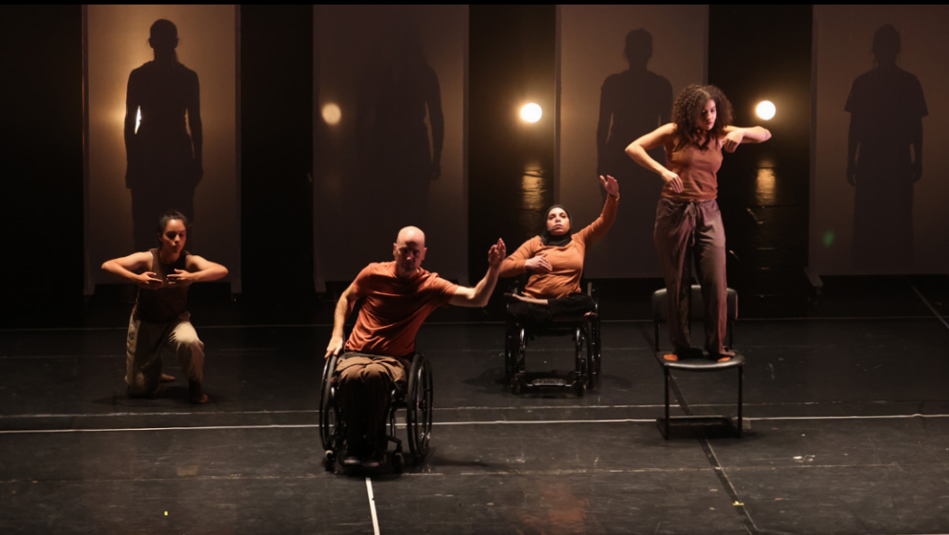
Bottom photo: USArtists International grantee Company | E (Washington, DC) performs Seen/Unseen with artists of Sareyyet Ramallah at the Ramallah Contemporary Dance Festival.

Open to presenters nationwide, the Performing Arts Global Exchange is an annually curated roster of international performing artists selected to tour to communities across the United States. Each year, a region is featured with a selection of artists across multiple disciplines. The program provides fee support directly to nonprofit presenters programming artists from the roster, and presenters host both public performances and community engagements in achieving the program’s goals of cultural exchange and understanding.