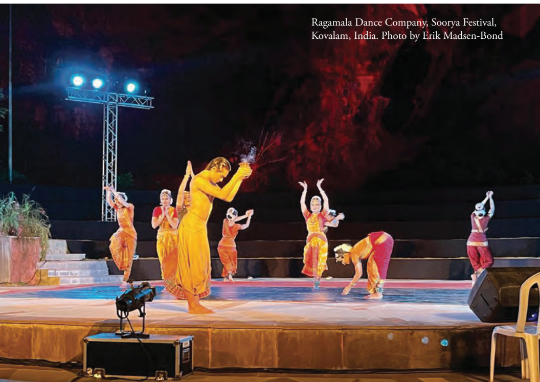
Ragamala Dance Company, Soorya Festival, Kovalam, India.

The benefits of being able to perform in India flow both ways, enriching audiences as well as the performers. Audience members are introduced to new ways of thinking about and performing the classical form, making it a living rather than static tradition. As the choreographers explained, "Bharatanatyam is traditionally performed by solo dancers. Thirty years ago, we were among the first to create and present contemporary ensemble work; we were able to do this largely because we were in the U.S. In a genre where most choreographers feel the need to choose between upholding tradition and breaking boundaries, we demonstrate through our work that we can be simultaneously culture-bearers and creative innovators. We strongly believe that, through our innovation, we keep our lineage alive."