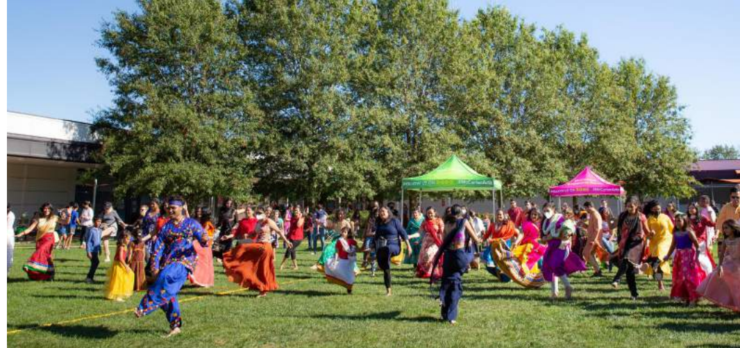
Top photo: McCarter Theatre Center (NJ) hosted Garba360 (NJ) with support from Mid Atlantic Tours.

Mid Atlantic Arts values the abundant and expansive diversity that exists within our region, our nation, and the world. We honor and celebrate the mid-Atlantic's people, artistic and community resources and, most notably, our many forms of cultural expression, and believe them to be major sources of strength in our region.