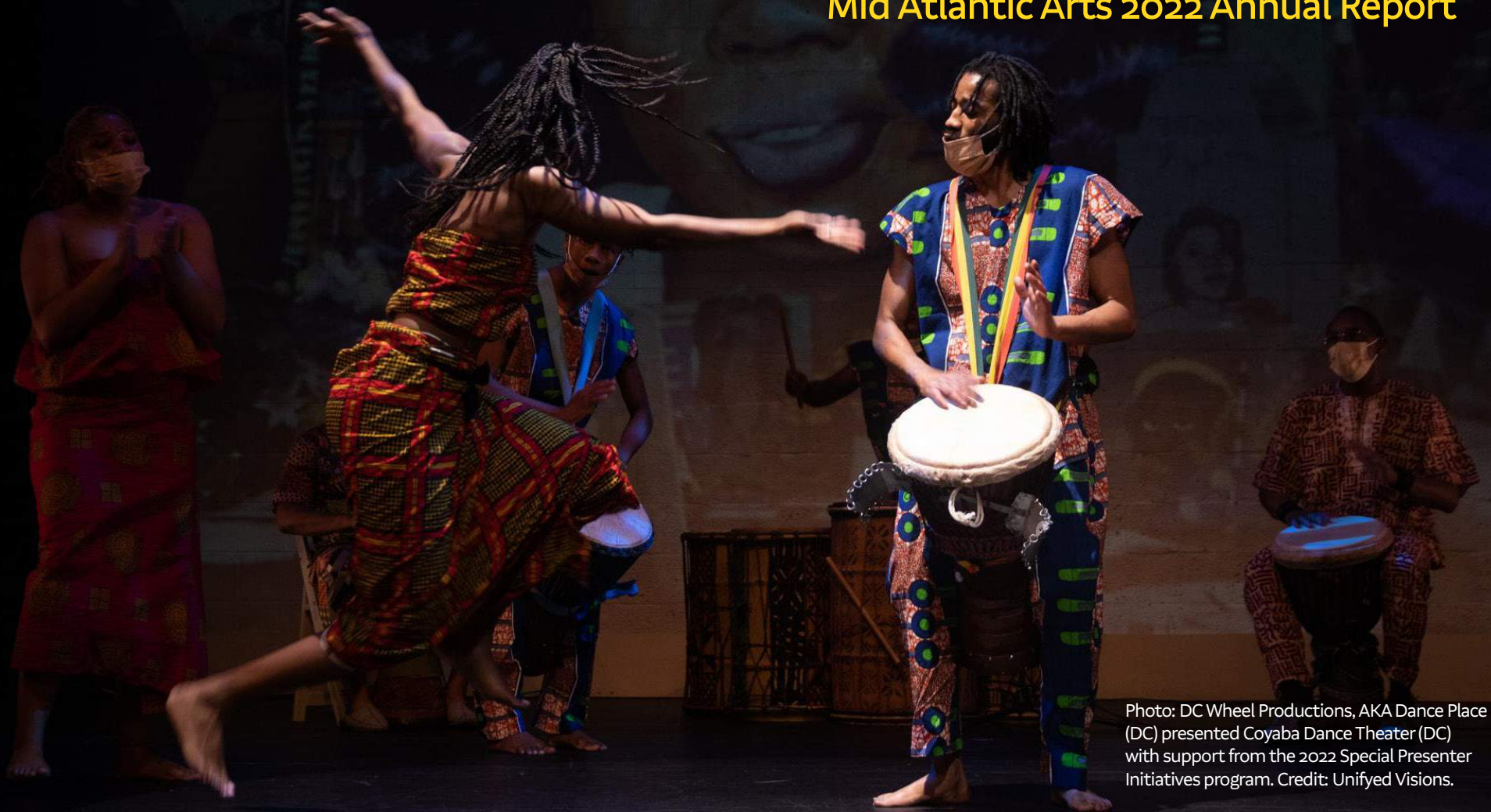
Photo: DC Wheel Productions, AKA Dance Place (DC) presented Coyaba Dance Theater (DC) with support from the 2022 Special Presenter Initiatives program. Credit: Unified Visions.