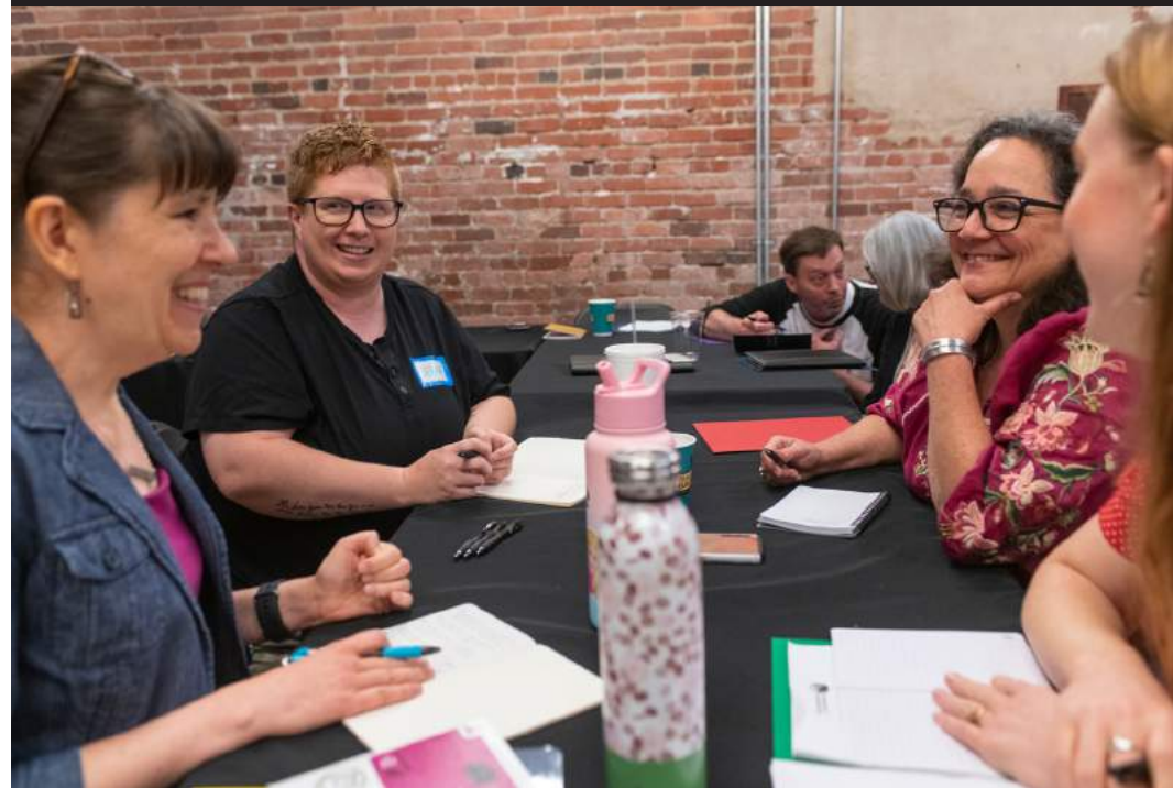
Bottom photo: Kick-off meeting of the Bristol Folk Arts and Culture Team (VA) for the Central Appalachia Living Traditions (CALT) Virginia Anchor Community project.