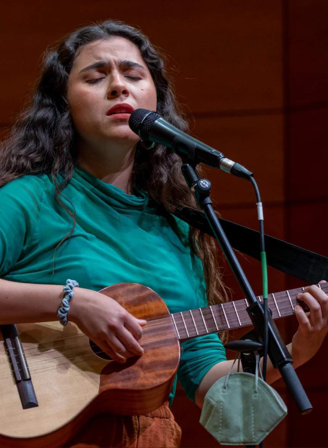
Photo: Performing Arts Global Exchange roster artist Silvana Estrada (Mexico) performed in the Tew Recital Hall at UNC Greensboro with support from grantee North Carolina Folk & Heritage Festival (NC).

Poetry Out Loud is a national poetry recitation contest that encourages high school students to memorize and recite great poems. It is a joint program of the National Endowment for the Arts and the Poetry Foundation. Mid Atlantic Arts produces the finals competition during which state and territorial winners from the United States compete for more than $100,000 in prizes.