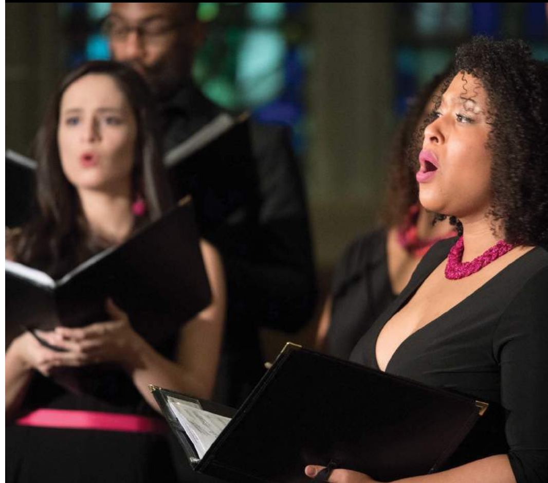
Bottom photo: EXIGENCE (MI) was hosted by The Choir School of Delaware (DE) with support from the Special Presenter Initiatives program.