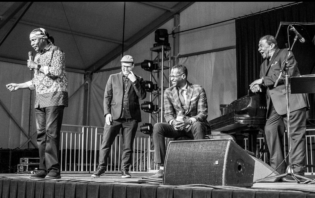
Bottom photo: With ArtsCONNECT support, the Virginia Arts Festival (VA) presented Buster Williams and Something More (NJ) in 2022.

Mid Atlantic Arts Creative Fellowships provide artists with the time and space to create. Hosted in partnership with Millay Arts and Virginia Center for the Creative Arts, writers, composers, and visual artists can apply for two-week, or one-month residencies underwritten by Mid Atlantic.