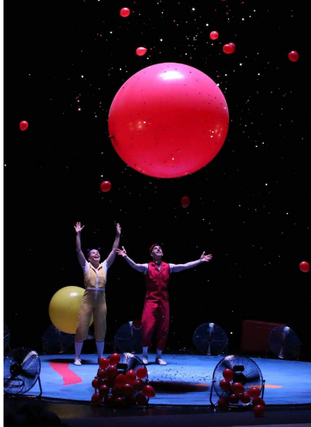
Photo: Acrobuffos (NY) perform Air Play at Frostburg State University (MD) in 2022 with support from Mid Atlantic Tours.