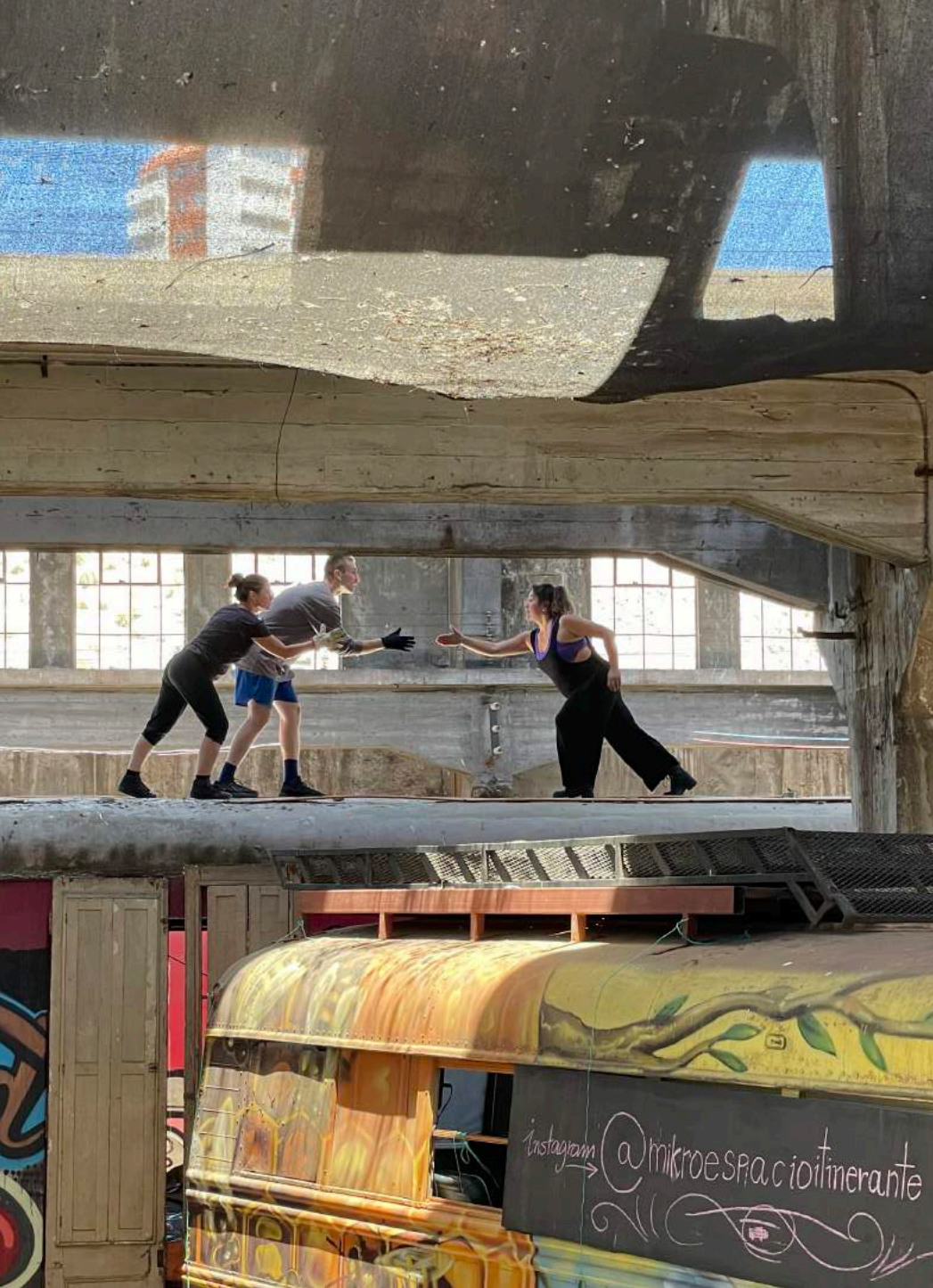
Photo: Site-specific collaboration between USArtists International grantee BODYART (CA) and Corredor de Danza Valparaíso at Maestranza Barón as part of their 2022 travel to Chile.

Build Mid Atlantic Arts' internal capacity to effectively respond to the needs of the field and address our mission.