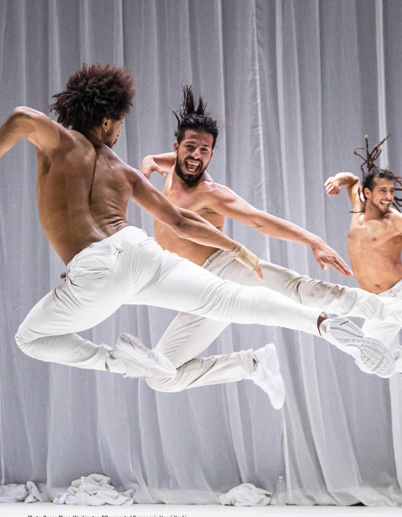
Photo: Dance Place, Washington, DC presented Compagnie Hervé Koubi, France, with support from ArtsCONNECT 2020.